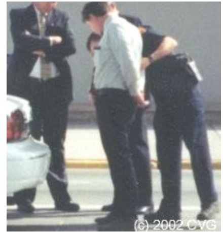
Search and seizure. Notebook and 300 Gospel tracts were not returned.

Since we did not violate any laws, then the searching and seizure of my property violates the Fourth Amendment of the Constitution.